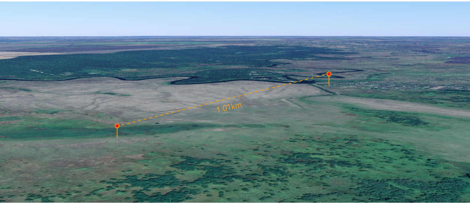
Map | LigoDLB 6-15ac Link (1.01km)